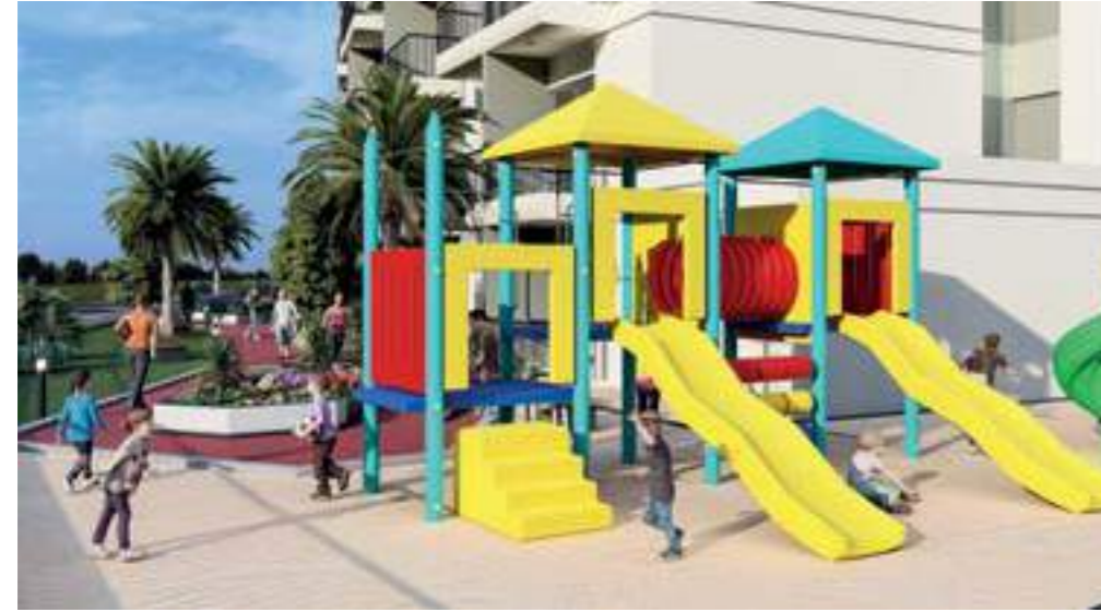
Kid's Play Area And Jogging Track