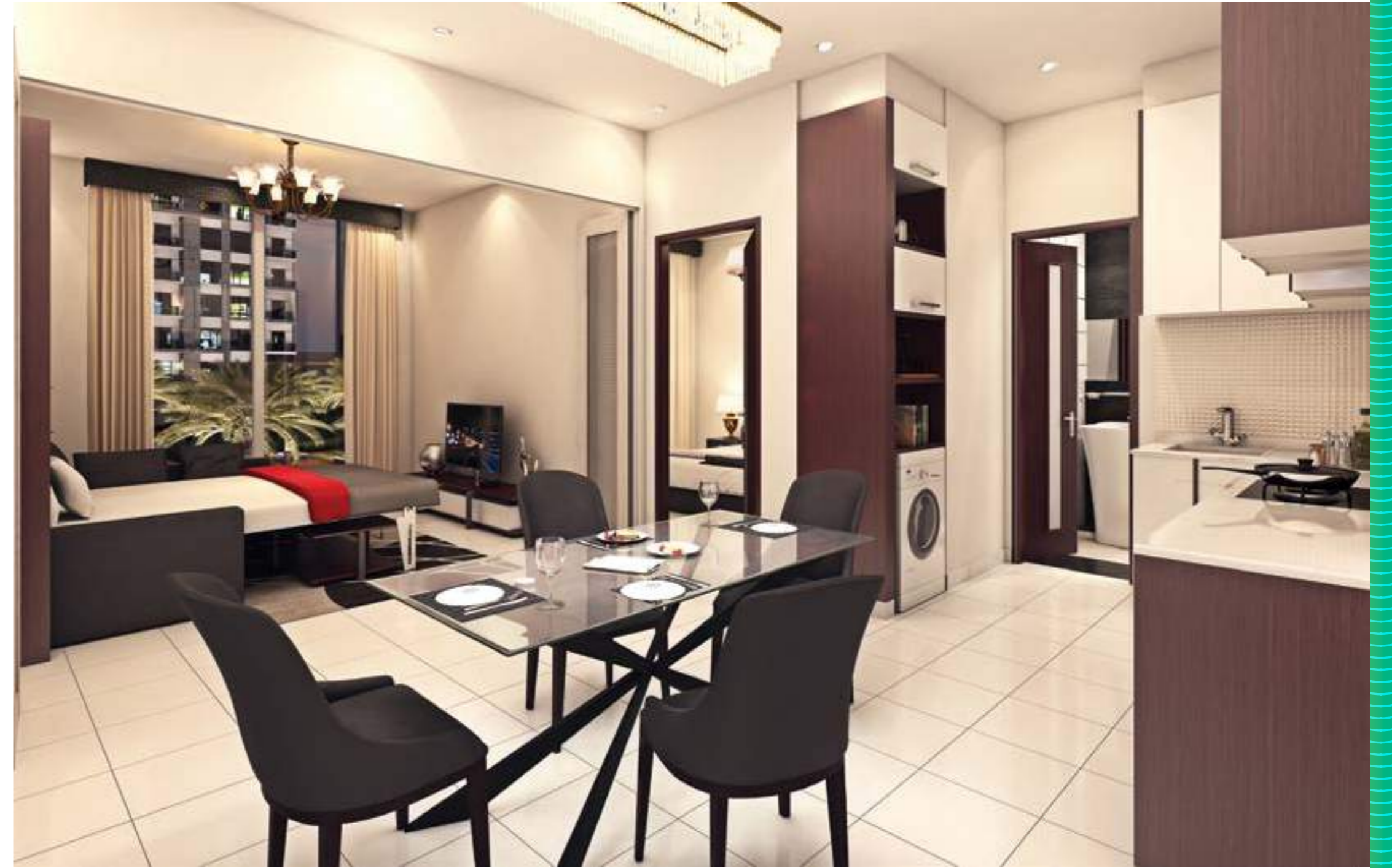
BEDROOM BY NIGHT

*Disclaimer: Please note that the apartments are unfurnished and furnishing will entail an extra cost.