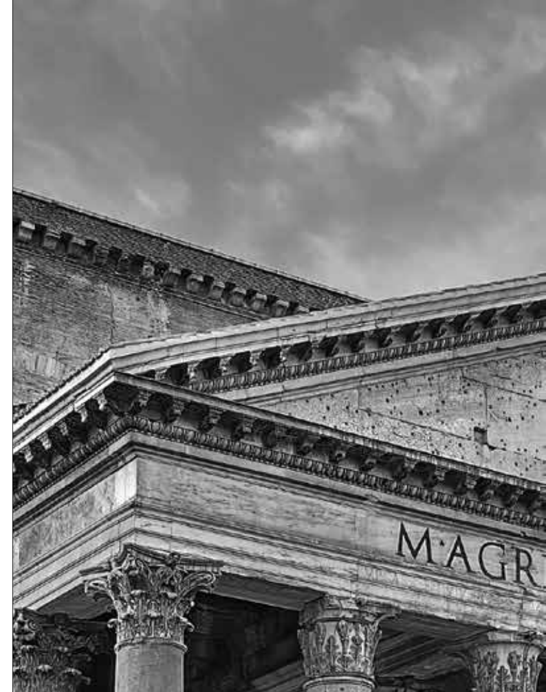
PANTHEON Ancient roman architecture

Benessere is inspired by the legacy of architecture that's almost two millennia old. But don't worry your palatial retreat will be ready in 2021 as we have our own legacy and reputation of timely delivery to preserve.