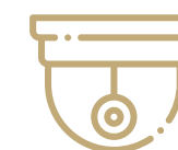
Sophisticated security system