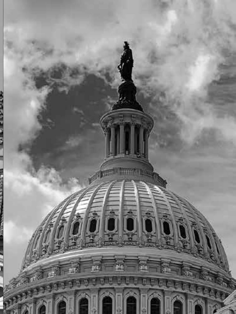
US CAPITOL Neoclassical architecture