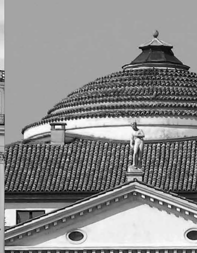
VILLA CAPRA Palladianism