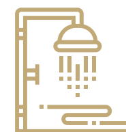
Luxurious bathroom fittings