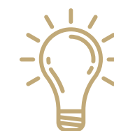
Lighting & fixtures