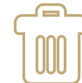
Ingenious waste disposal system