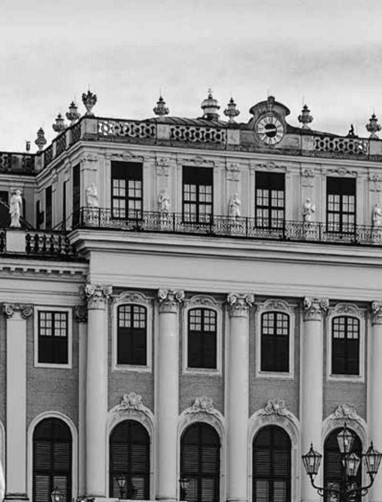
SCHONBRUNN PALACE Boroque architecture