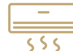
World-class air-conditioning system