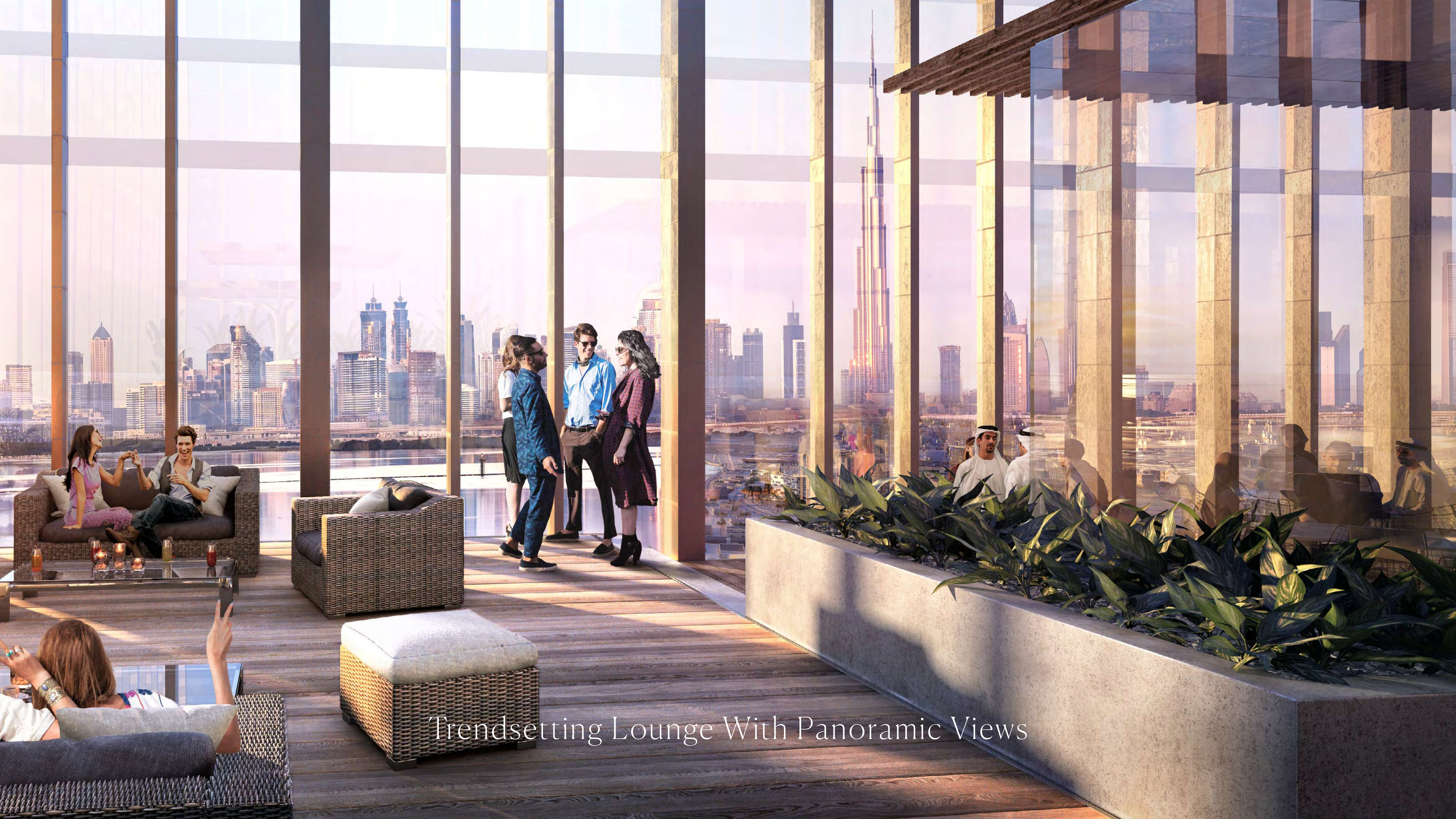
Trendsetting Lounge With Panoramic Views