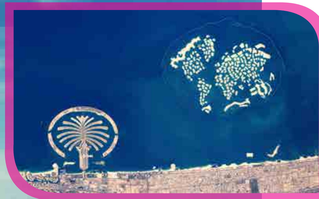
THE WORLD ISLANDS