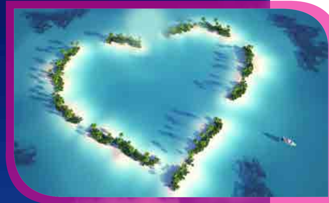
THE HEART OF EUROPE