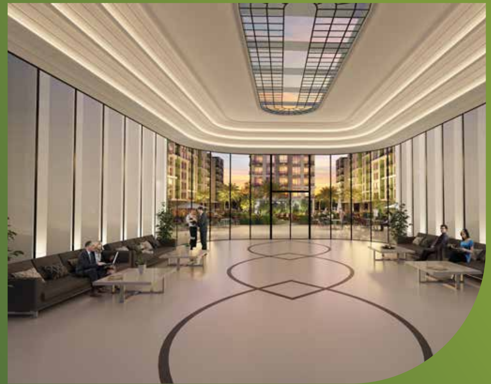
MULTI-PURPOSE PARTY HALL