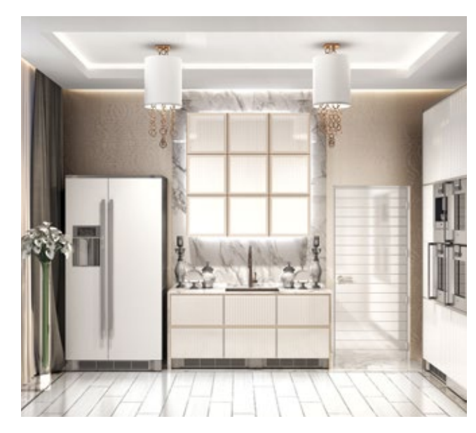
DESIGNED WITH DISCRETE LUXURY

Sophisticated interiors with exquisite finishes.