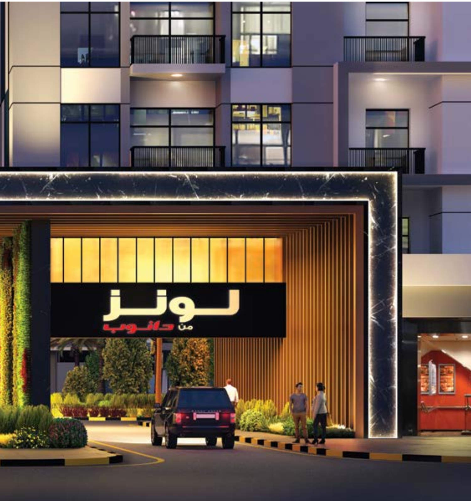
GRAND COMPLEX ENTRANCE