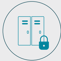
Changing rooms and lockers