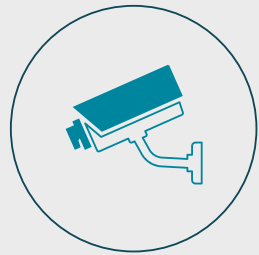
Safe & secure residential building