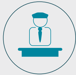
Spacious lobbies with concierge service