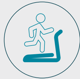
Stand-alone bespoke gym