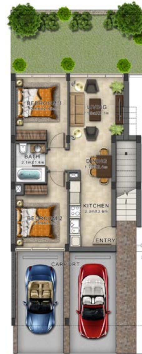
TH2G-MU / Ground