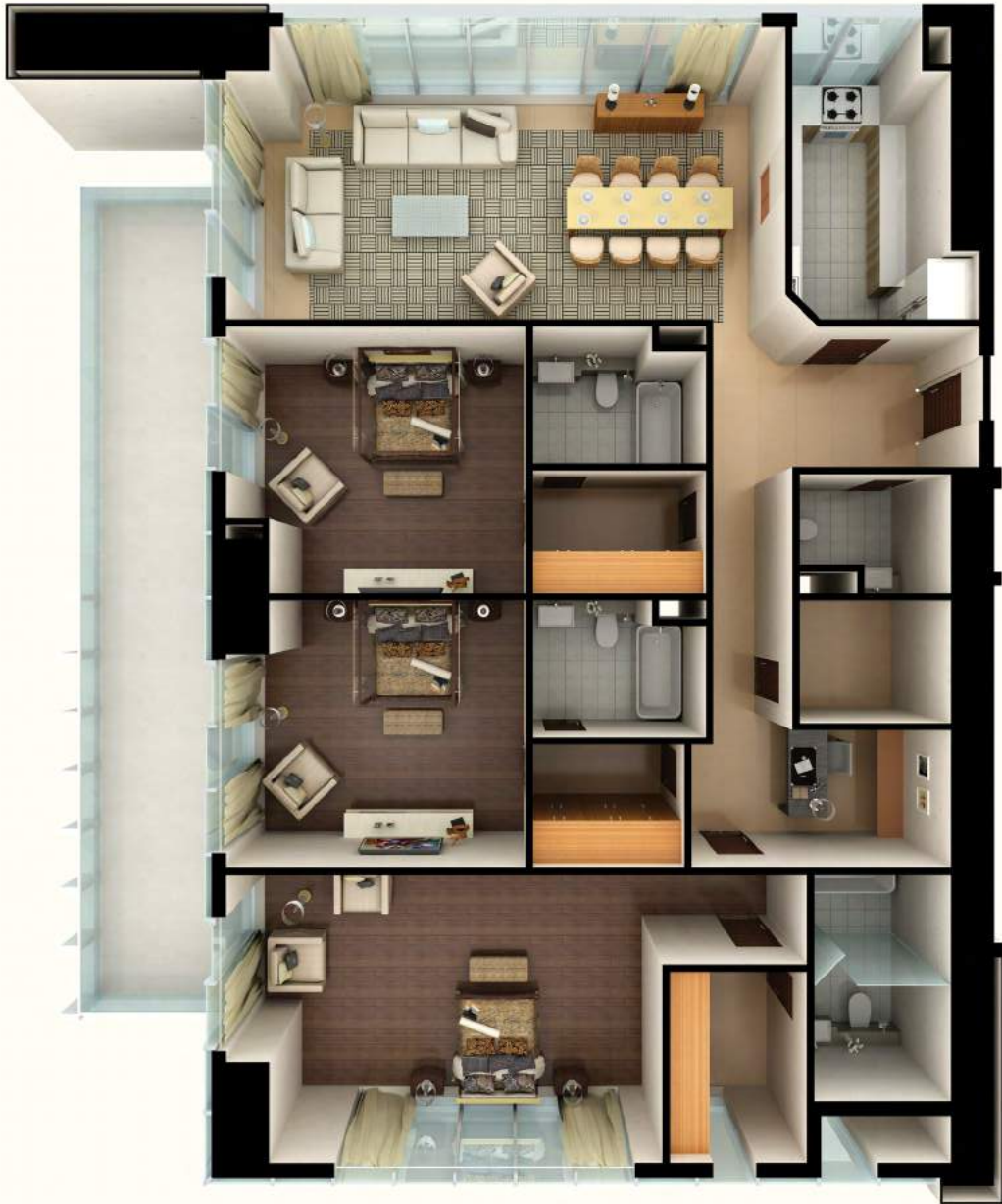
UNIT PLAN THREE BEDROOM