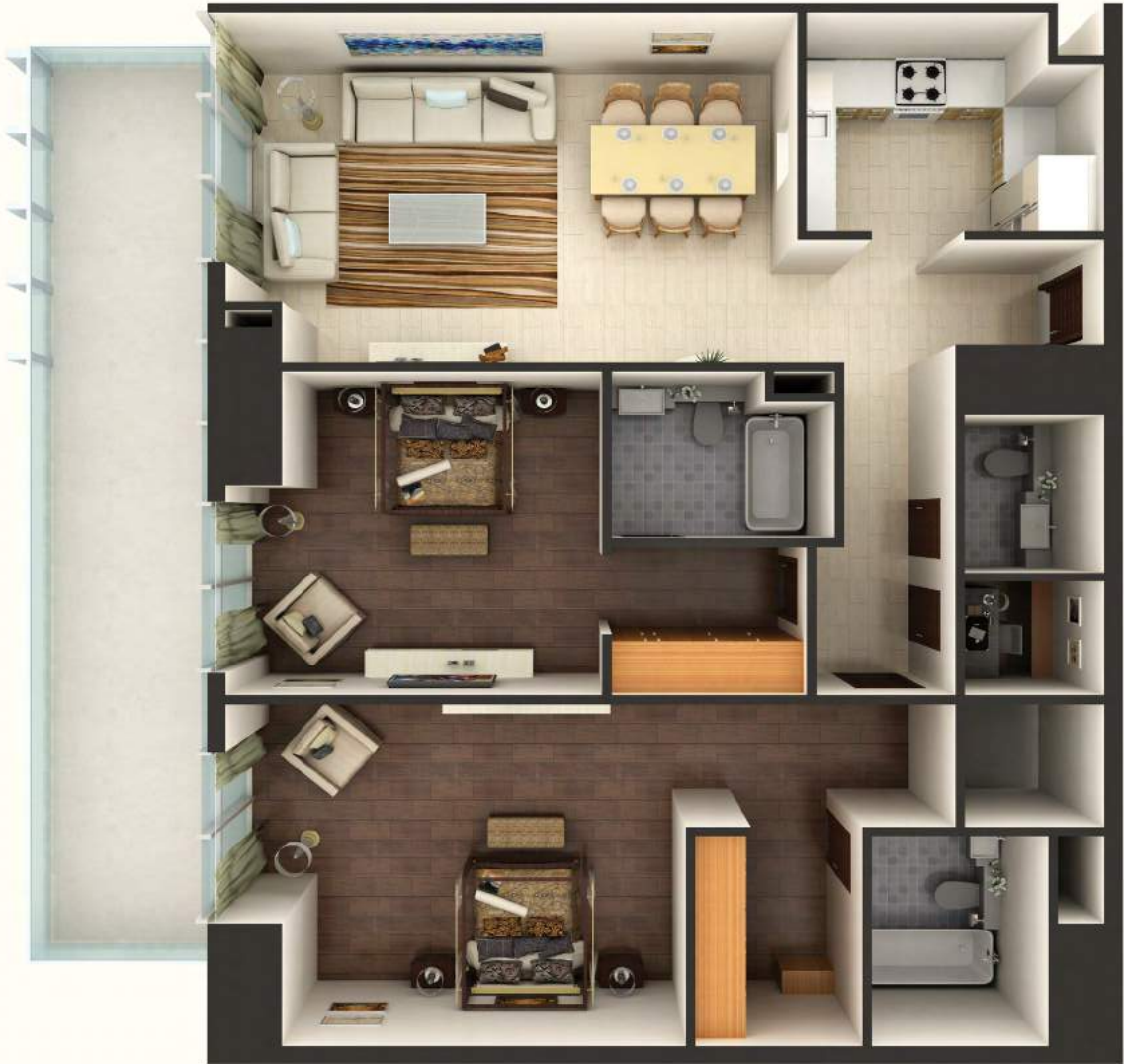
UNIT PLAN TWO BEDROOM