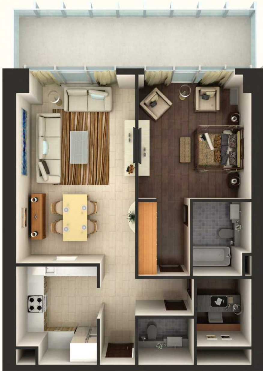
UNIT PLAN ONE BEDROOM