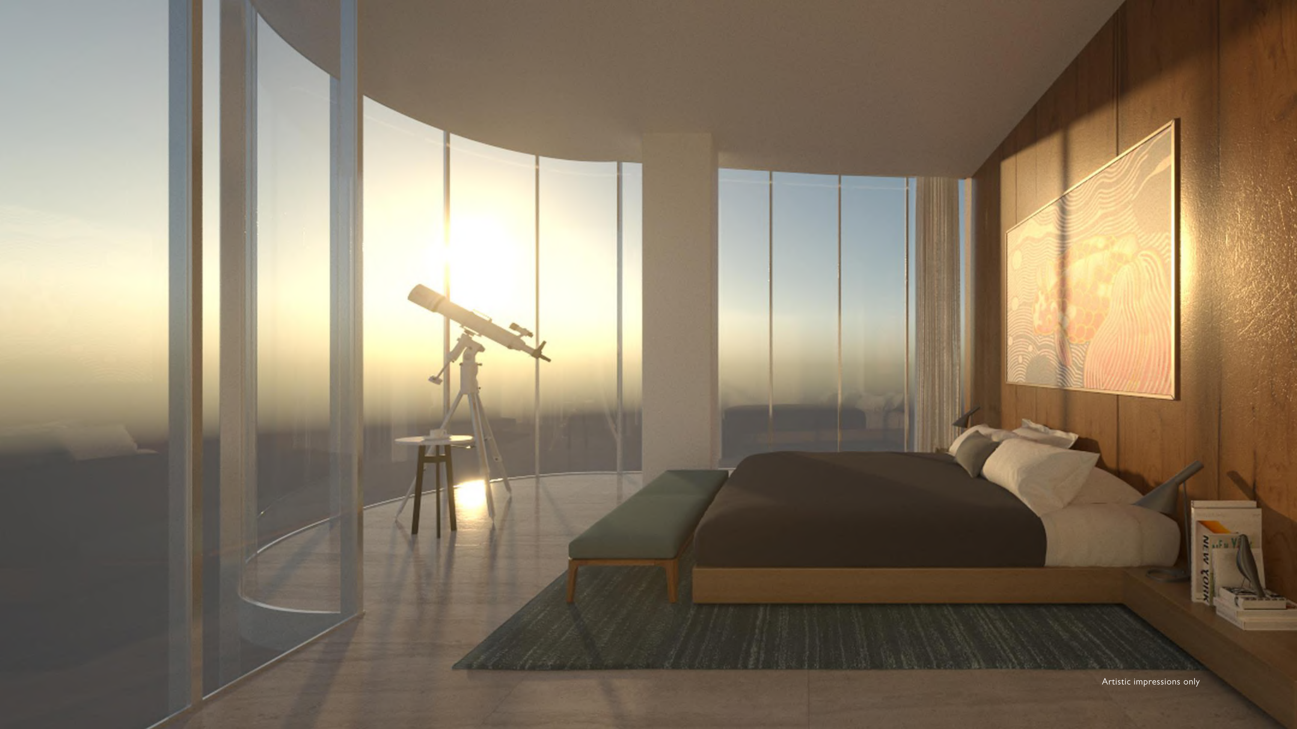
Artistic impressions only