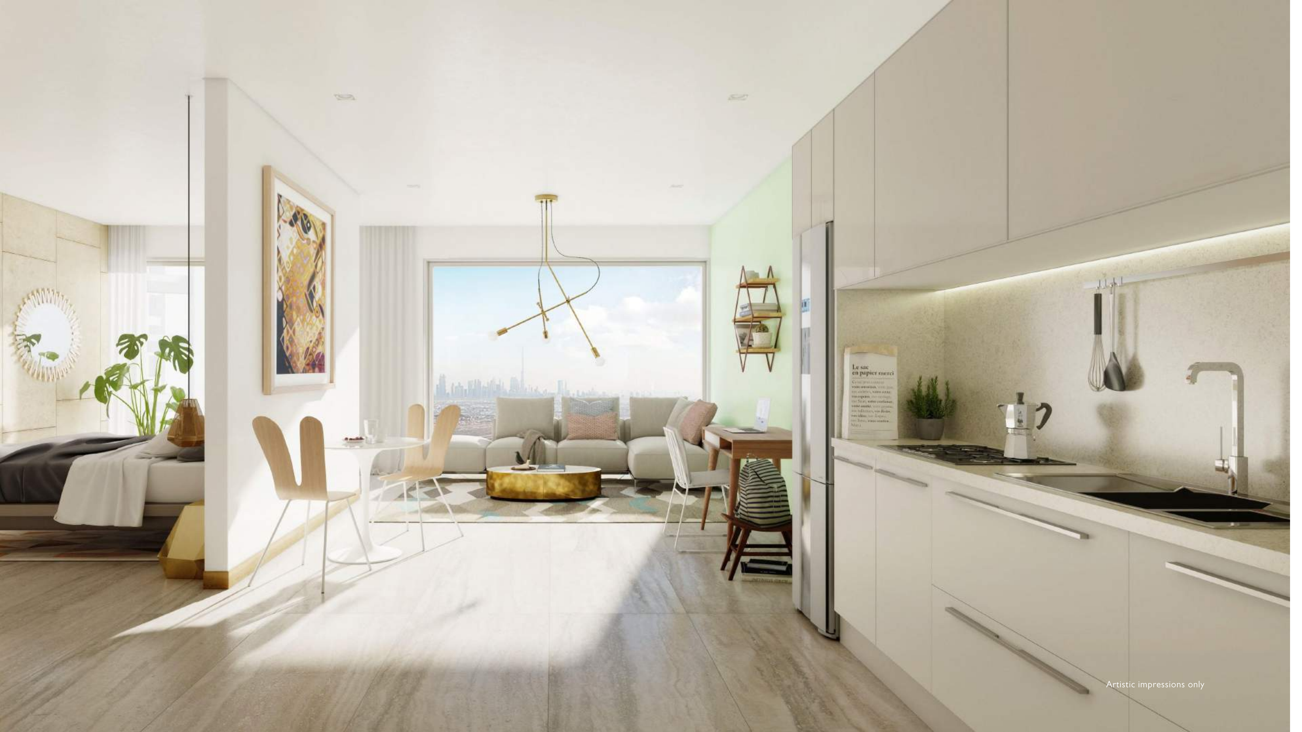
Artistic impressions only